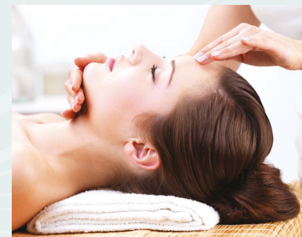
FACIALS FOR SKIN HEALTH & APPEARANCE

*Research sources: Roehampton University on massage and benefits including immunity cells, FIFA on sports & massage, International Journal of cosmetic science, McKinsey